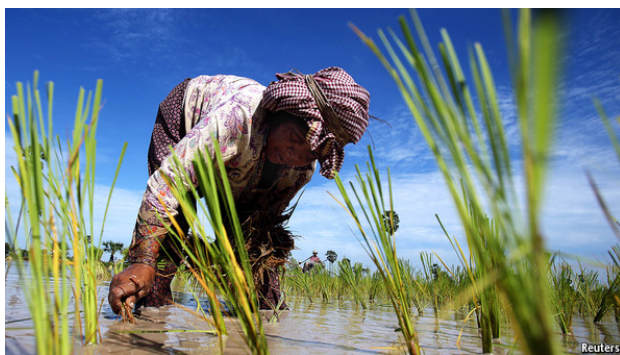
Seeding the next revolution

On the face of it, the second revolution is subsidised. Not only do governments finance the basic research. In many Asian countries, from rice importers such as Indonesia to exporters