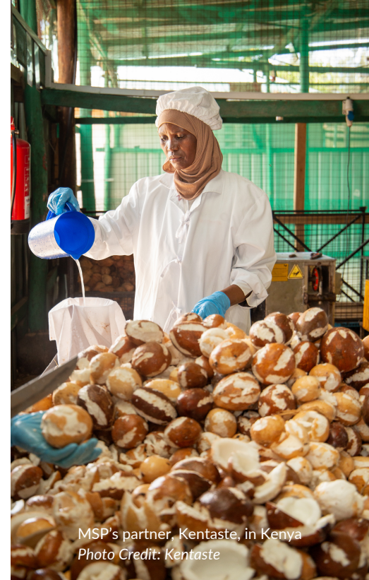
MSP's partner, Kentaste, in Kenya